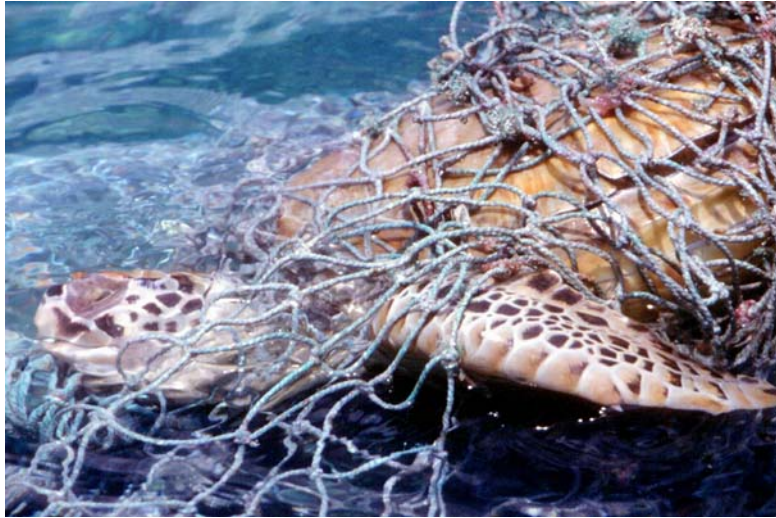
Green turtle that drowned because it became entangled in a discarded net