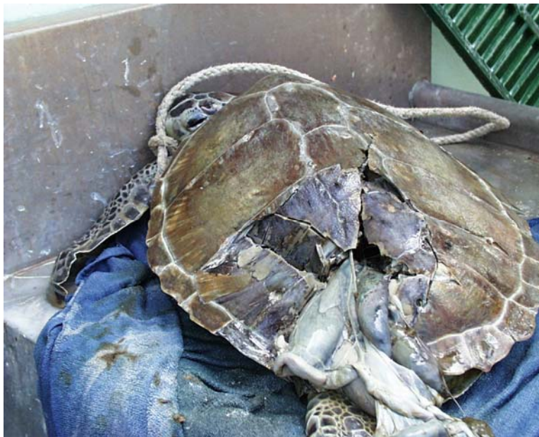
Green turtle that was hit and killed by a boat