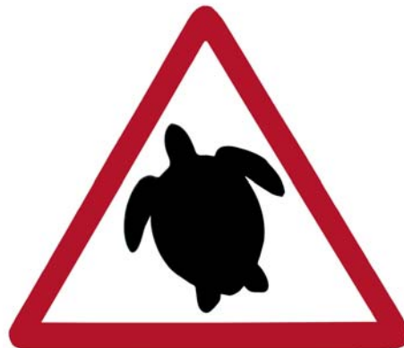
‘Turtle Alert’ sign advising boaters to slow down

A little bit of extra effort can go a long way to reducing that annual admission rate of stranded turtles into BAMZ as well as the number of turtle deaths around Bermuda.