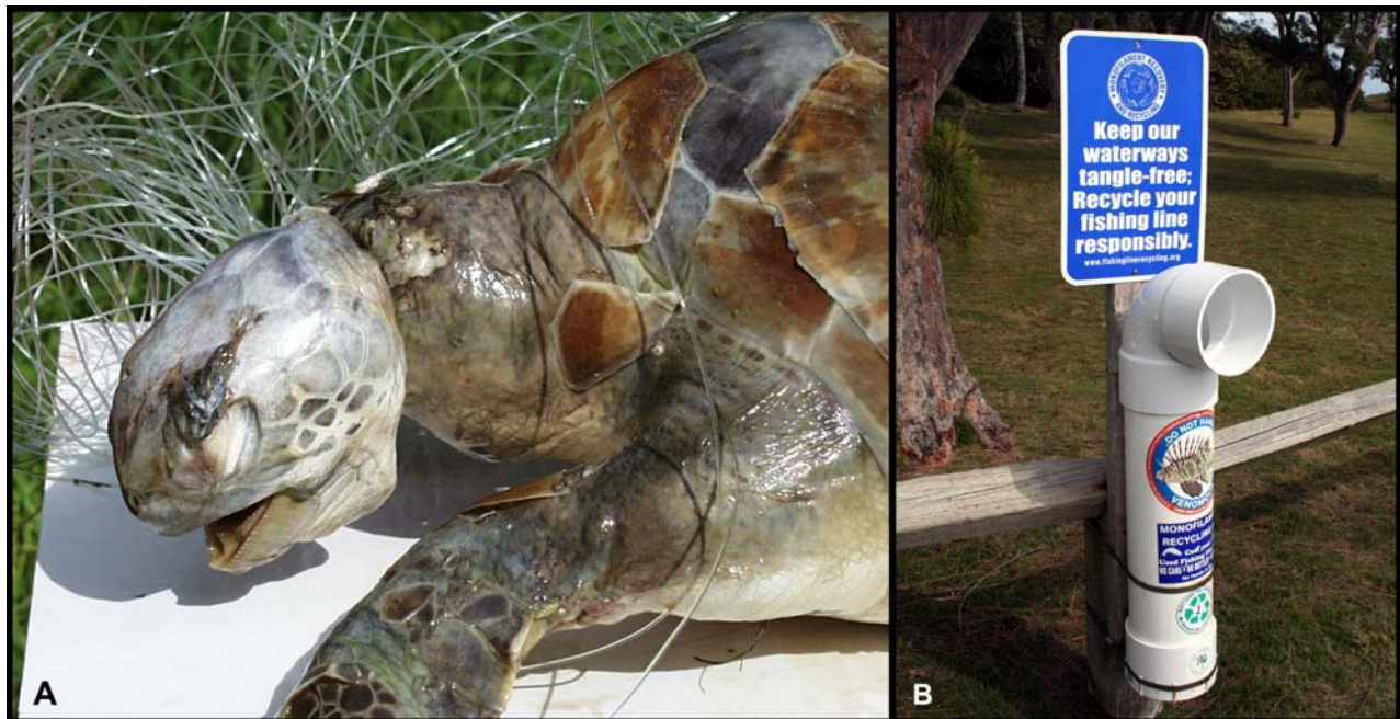
Strangulation and drowning of a juvenile green turtle caused by entanglement in monofilament fishing line (A) and receptacle for discarded monofilament fishing line at a shoreline location in Bermuda (B).